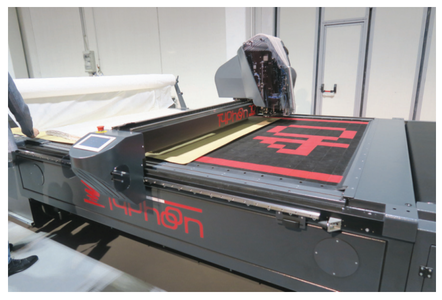
IMA's new CAM, Typhoon 70

late events defined by the customer. In addition, new loader and spreading machine as evolutions of 808.10 loader and 890 spreader were also demonstrated.