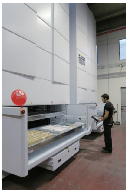
The scenes of the new factory of IMA Spa

Typhoon 70 drew the participants' attention as a new-type item. Typhoon was developed by IMA's 12 expert R&D staffers taking about 2 years from the conceptual determination. Typhoon 70 is scheduled to market