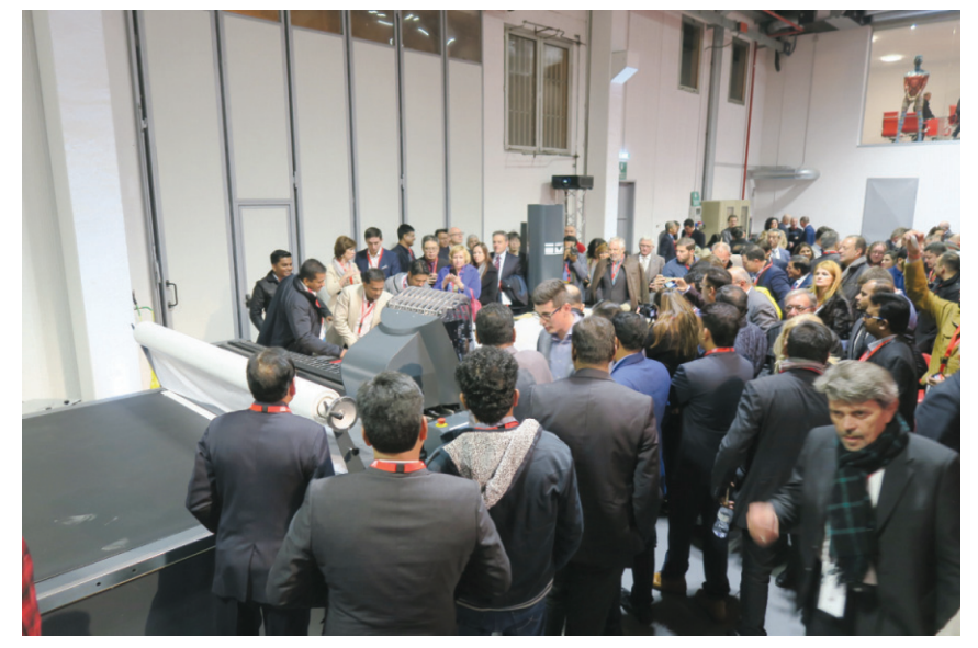
New CAM product, Typhoon 70 drew the participants' attention as a new-type item

which nowadays is for use both on the web and within the corporate network.